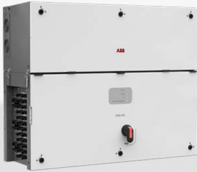
— PVS-175-TL three-phase outdoor string inverter